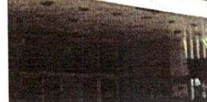
STATE THEATRE: A fixture in downtown Kalamazoo since 1927, the State Theatre is a great place to take in a concert amid some of the most awe-inspiring interior decor you'll ever see. The combination of tradition, meticulous renovations and an interior laden with color, texture and ornate fixtures is what makes the State great. It was closed in 1982, but a "Save the State" committee formed and the community celebrated when the Hinman Co. re-opened it in 1985. Wonder when Stevie Wonder's gonna play there.