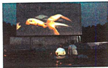
SUNSET AUTO THEATER: A double feature at 12 bucks a carload? What year is this, 1956? Not quite, but it sure feels like it when you drive to Hartford to take in a couple of movies at the old-fashioned drive-in. The concession-stand ads are vintage, but the flicks are first-run. No more of those speakers that hang from the windows, either. Simply tune your radio to 93.1 FM and relax. Come early because the place is packed on Friday and Saturday nights. No wonder.