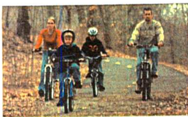
A) KAL-HAVEN TRAIL; B) PORTAGE CREEK BICENTENNIAL PARK BIKEWAY: Looking for two ways to enhance your bicycling pleasure? Wonder no more. These two majestic trails offer cycling in contrast. Whether you want to weave throughout the city of Portage, or take a straight path down an old railbed in Van Buren County, this is biking at its best. The city of Kalamazoo once promised to build its own trail to connect these two great paths. I wonder when.