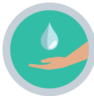
Wash your hands frequently