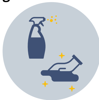
Clean & disinfect surfaces often