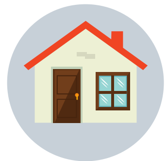
Stay at home if you're sick