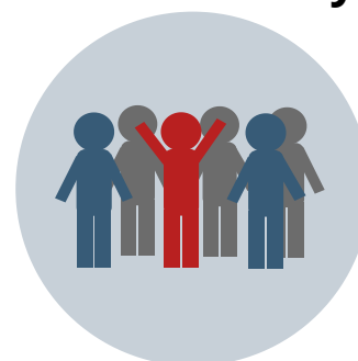
Avoid exposure at large gatherings